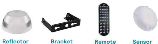
Reflector Bracket Remote Sensor

NOTE: Many luminaire components, such as reflectors, lenses, sockets, lampholders, and LEDs are made from various types of plastics which can be adversely affected by airborne contaminants. If sulfur based chemicals, petroleum based products, cleaning solutions, or other contaminants are expected in the intended area of use, consult factory for compatibility.