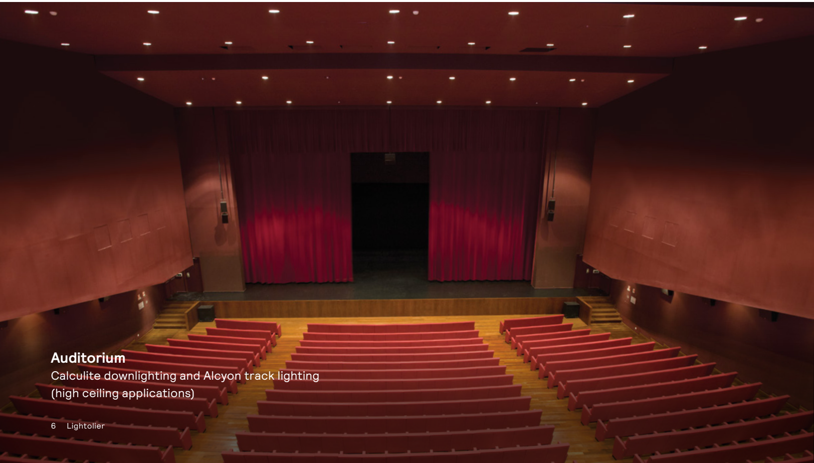
Auditorium Calculite downlighting and Aleyon track lighting (high ceiling applications)