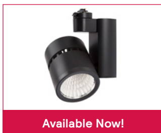
Alcyon Vertical Track Heads