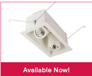
OmniSpot Recessed Multiple Cylinders