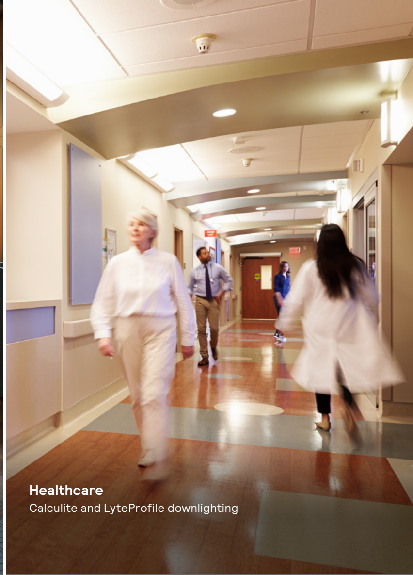
Healthcare Calculite and LyteProfile downlighting