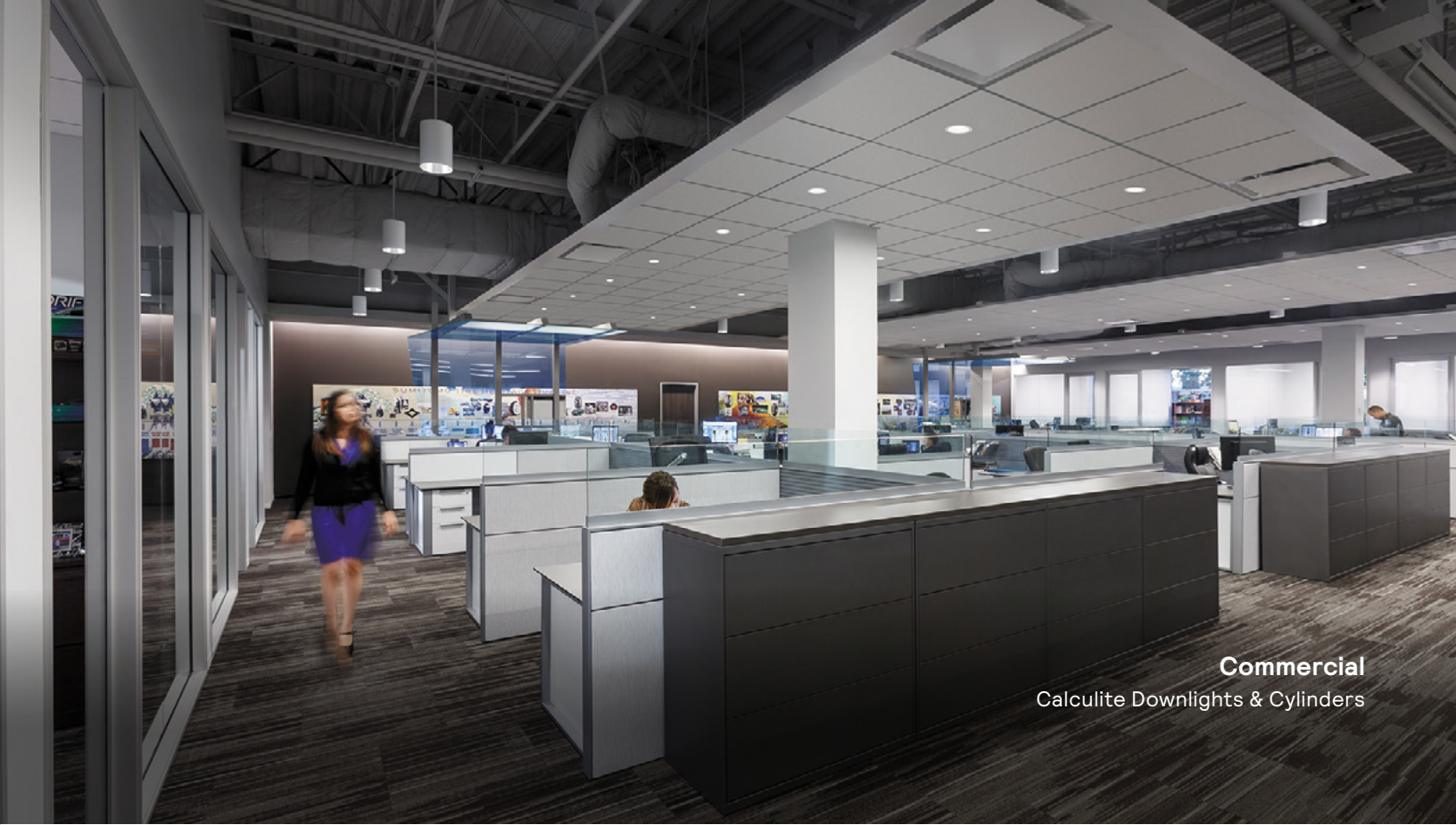
Commercial Calculite Downlights & Cylinders