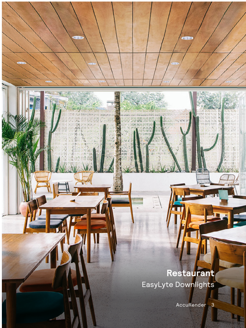
Restaurant EasyLyte Downlights