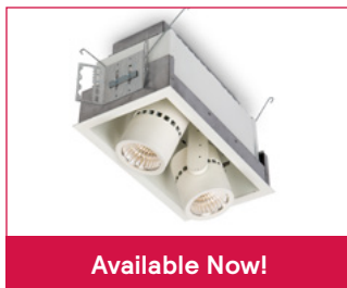
Alcyon Vertical Recessed Multiple Cylinders