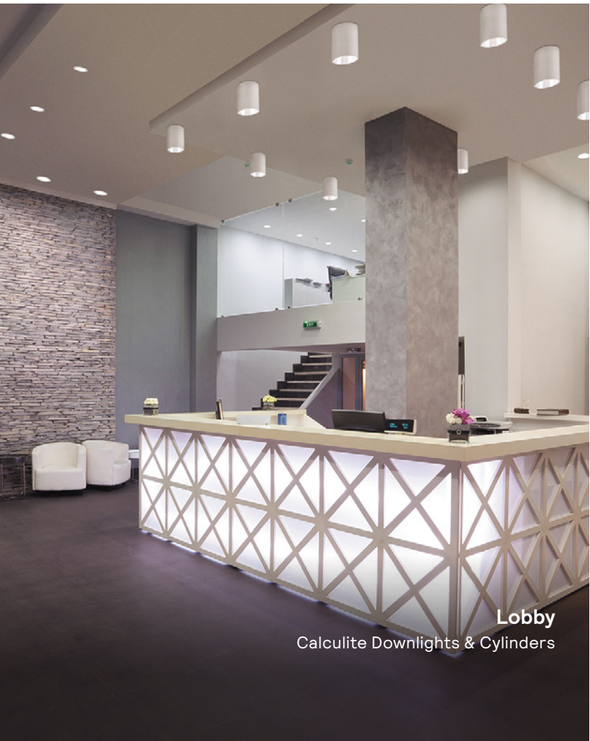
Lobby Calculite Downlights & Cylinders