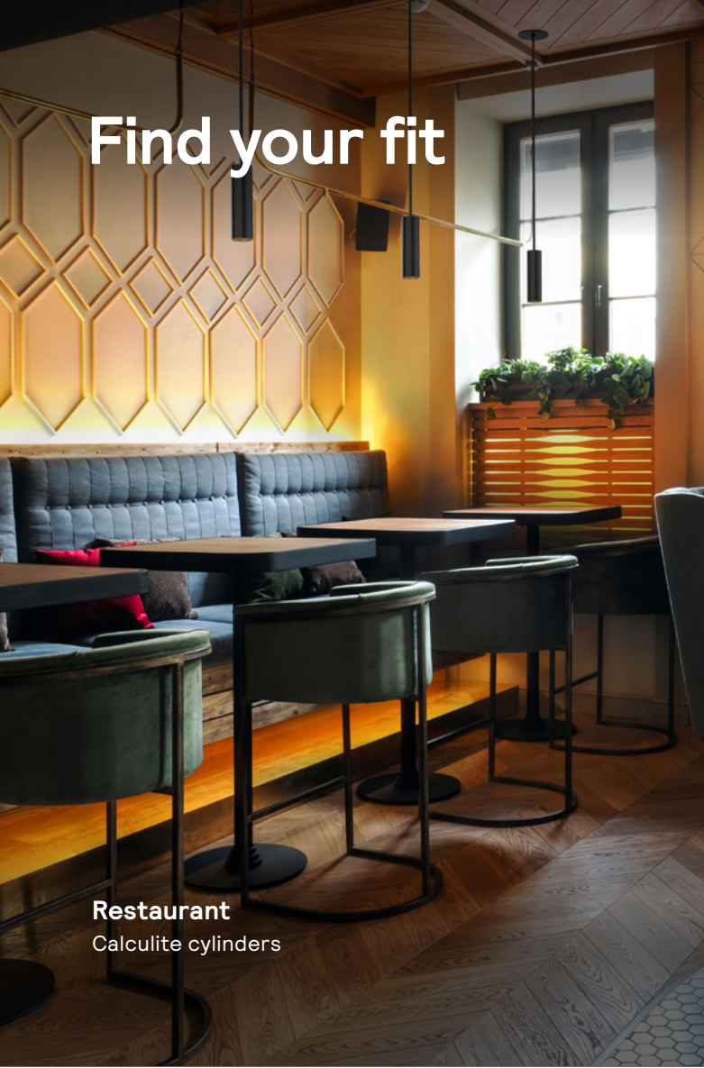
Restaurant Calculite cylinders