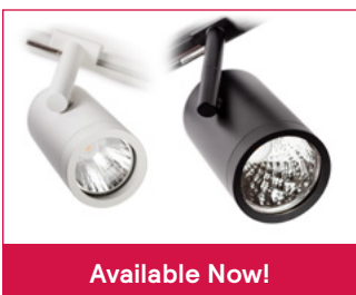
OmniSpot Track Heads