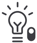
Lumen Select Switch

Benefit from commercial quality downlighting equipped for renovation, retrofit, and new construction projects with ModuLyte. Meeting job timelines, staying within budget, and navigating changing decisions just got a lot easier with modular design that puts flexibility at your fingertips.